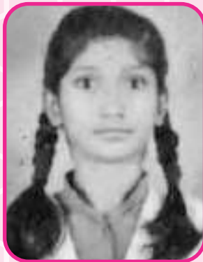
MADURI DIXIT 97.8%