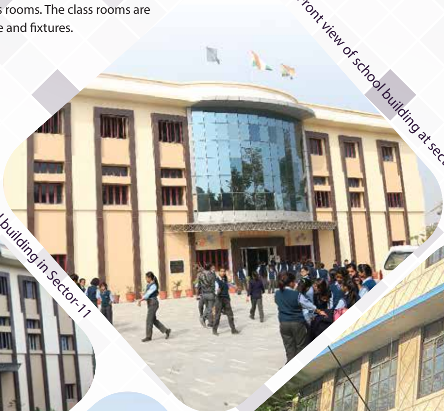
Imposing Palatial building in Sector-11