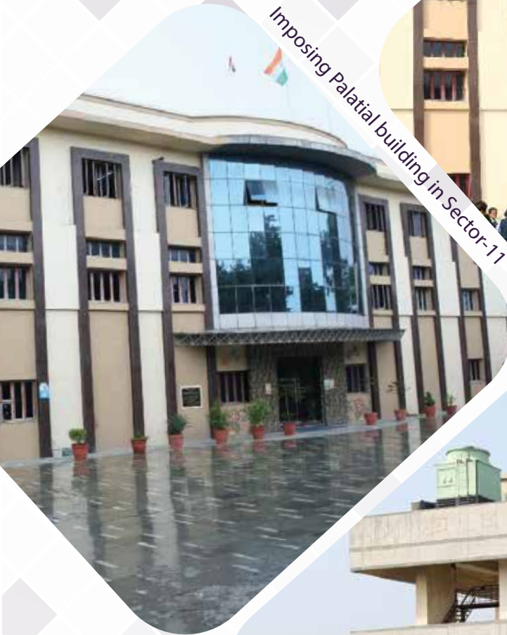
Imposing Palatial building in Sector-11