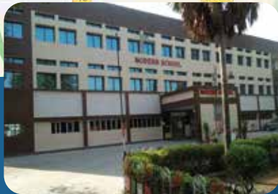
Sector 17, Faridabad, Ph. No. : 0129-2286615, 7982034565 www.modernschoolfaridabad.com

We aim to provide 'out - of - the-box' learning in a creative environmental image.