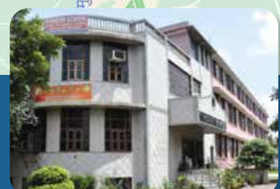
Plot No. 2, Sector 1, Vaishali Ph. No. : 0120-4236548, 4296548 www.modernschoolvaishali.com