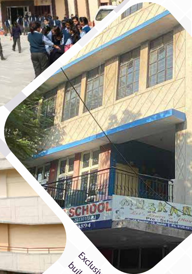
Exclusive Tiny Tot's building at Sector-12