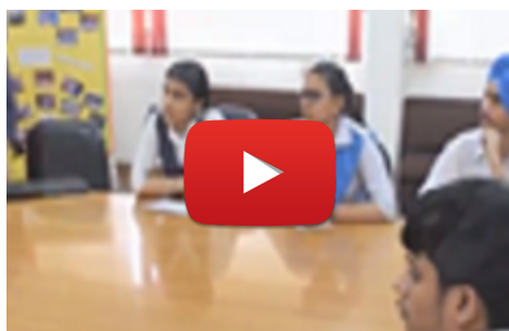
Journalism Training at Guru Ha Video Link: Click Here