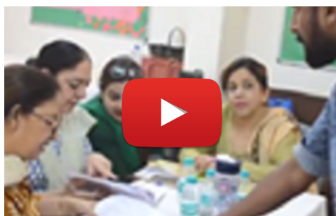
The Magnificent #PhonicsTraini Video Link: Click Here